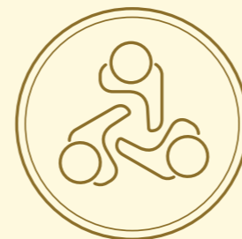
Culture and Leadership