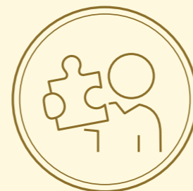
Services and Supports